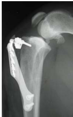
Tibial Tuberosity Advancement

This is similar to the TPLO in that it uses an osteotomy (bone cut) to alter the stifle's (Knee joints) biomechanics to regain stability of the joint. It does this by repositioning the attachment of the patella tendon. Once repositioned it is held in place with a titanium cage, plate and screws.