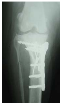
Tibial Plateau Leveling Osteotomy (TPLO)